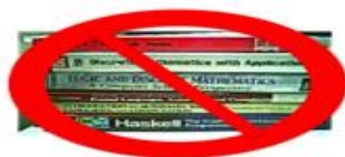
No text book to buy