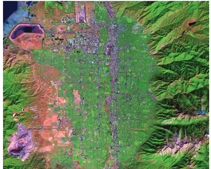
Landsat 8, Salt Lake City, Utah, September 19, 2015.