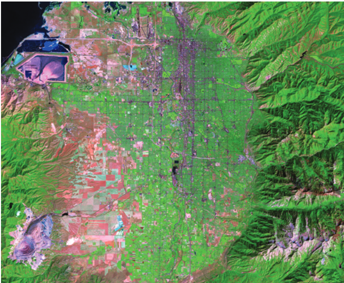
Landsat 5, Salt Lake City, Utah, August 31, 1985.

The Landsat satellite image collection is valuable because it shows change over time of the Earth's land surfaces. Look at these two images and find at least five things that have changed between the two time periods.