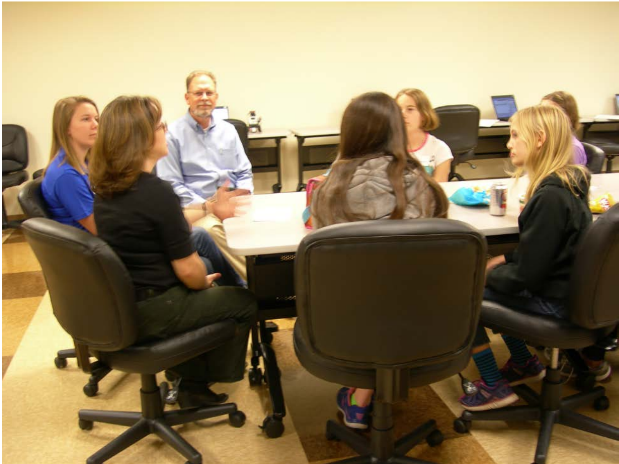
Figure 2-3. Workshop participants discuss transportation engineering with UFTI leaders.

discussion lead into the LEGO robotic vehicle lesson plans. Fourteen girls participated in each of the single day workshops.