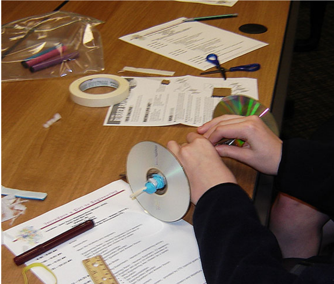
Figure 2-1. Participants at the Introduce a Girl to Engineering workshop assemble a rubber band car.