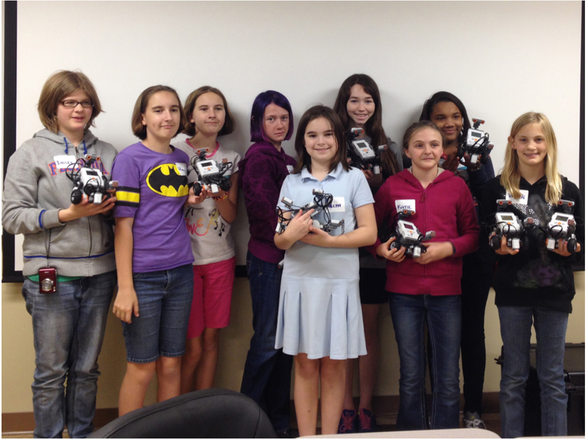
Figure 2-4. Workshop participants display the LEGO® robots they programmed and tested.