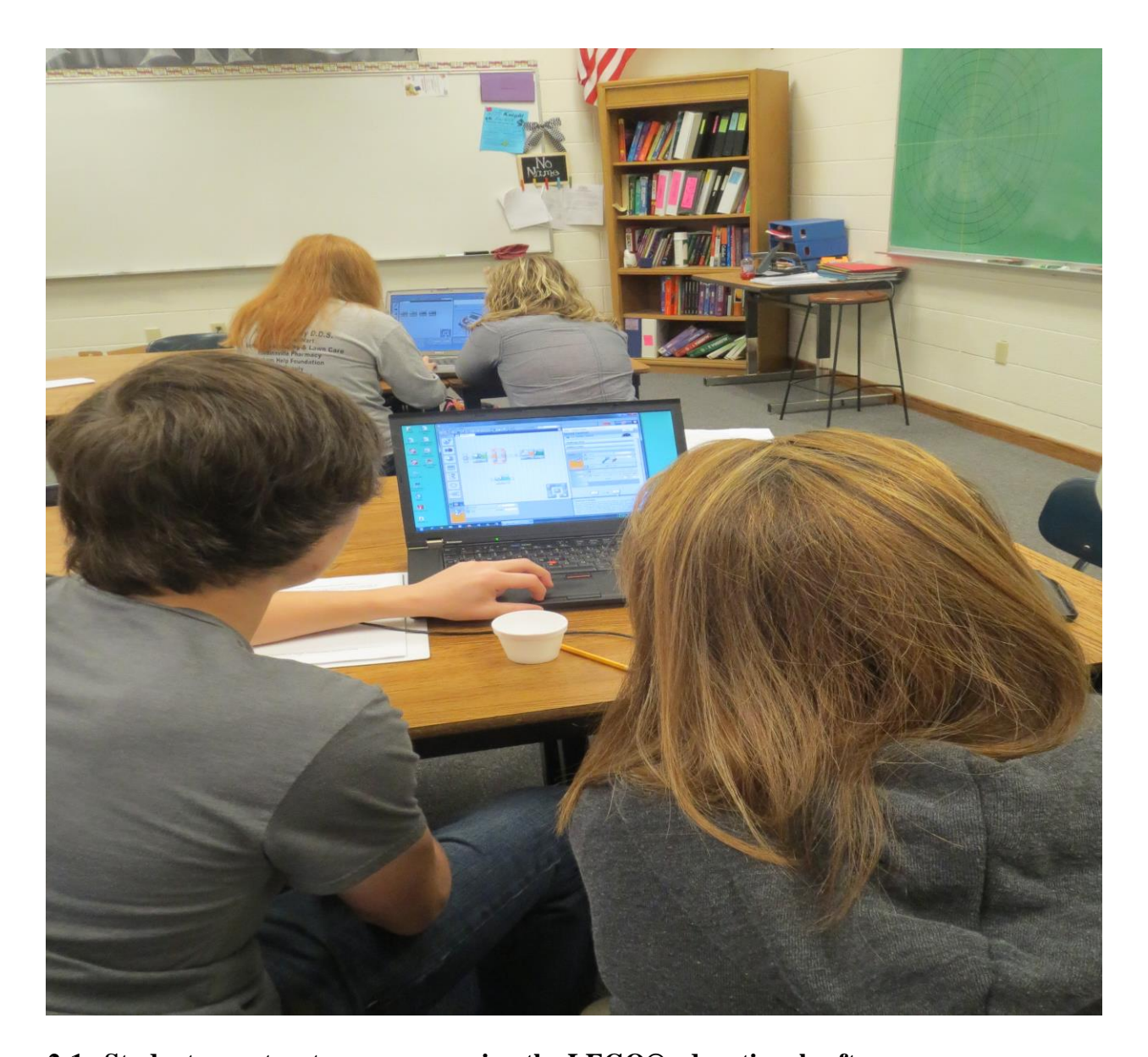
Figure 2-1. Students construct a program using the LEGO® educational software.

Interpersonal and communication skills were stressed as students were divided into four teams. They were given tutorials that presented scenario problem statements to work on throughout the sessions. Combined with PowerPoint presentations and demonstrations, students worked hands-on with pre-built LEGO® NXT Intelligent Vehicles and LEGO® education software (see Figure 2-1). Measurement criteria in the lesson plans consist of pre- and post-tests, lesson review worksheets, and mini assessments.